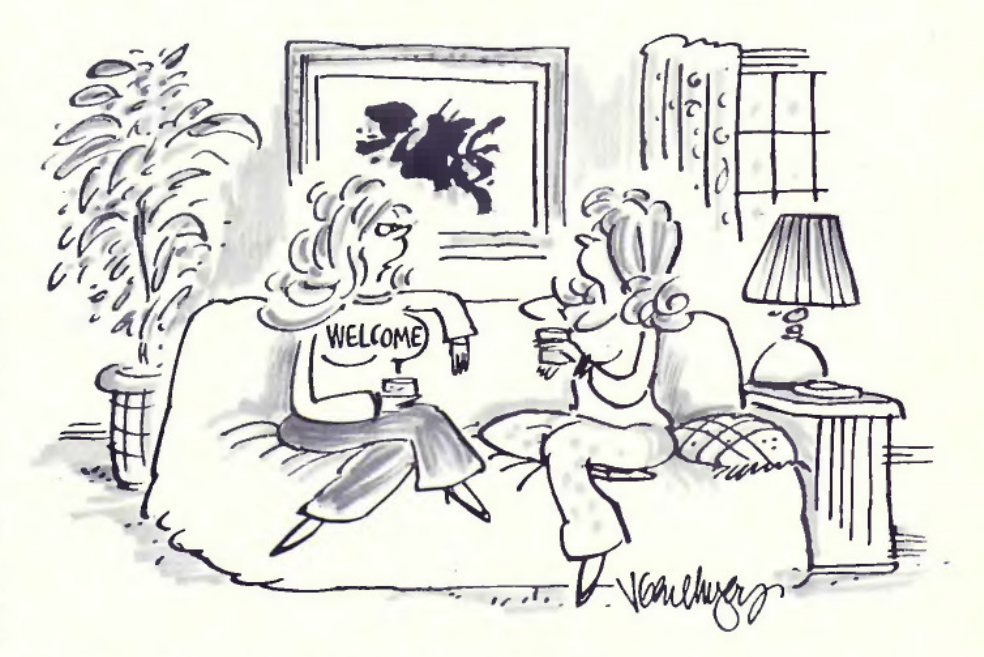
"T'm getting fed up with men. Every one I meet treats me like a door mat."