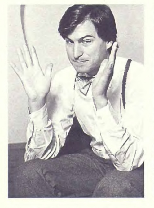
"A lot of the Sixties people ended up not really accomplishing what they set out to accomplish, and because they had thrown their discipline to the wind, they didn't have much to fall back on."

But to hear Jobs tell it, the money isn't even half the story, especially since he does not spend it very lavishly—and, indeed, claims to