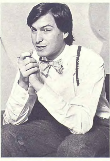
"The IBM PC fundamentally brought no new technology to the industry at all. It was just repackaging and slight extension of Apple II technology, and they want it all. They absolutely want it all."