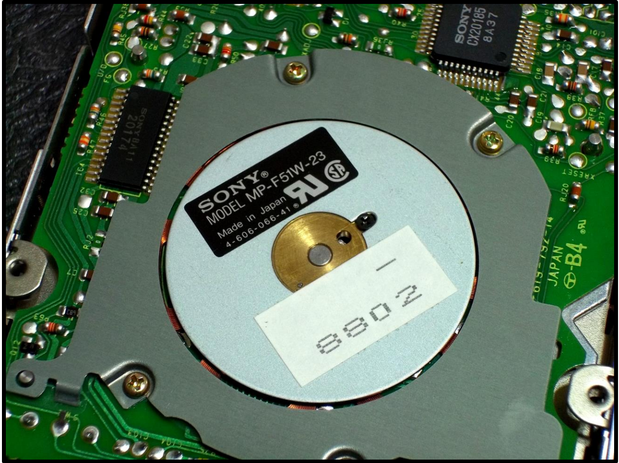
Figure 4. The Sony 3.5 floppy disk drive mechanism used in the Apple 1.44 Mb floppy disk drives.