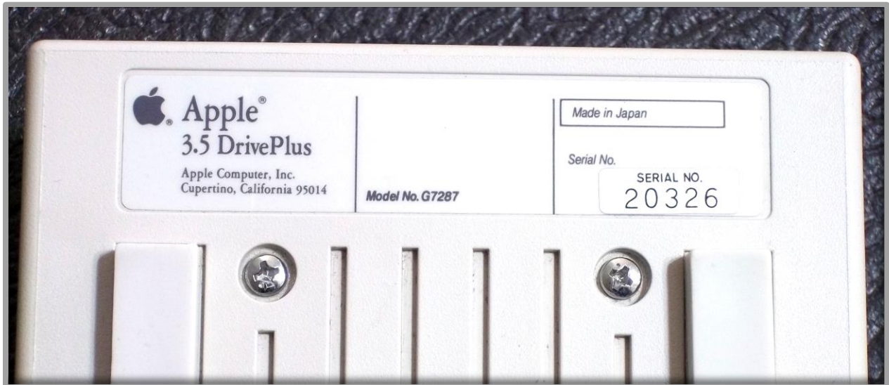
Figure 1. The Apple 3.5 DrivePlus, Model No. G7287.

Up until now it has been generally acknowledged that Apple's 1.44 Mb 3.5" drive was manufactured and marketed under two names, both bearing the G7287 model/family number – the Apple 3.5" FDHD drive and the Apple SuperDrive. But I have recently acquired another Apple 3.5" 1.44 Mb drive that is labelled with another name: the Apple 3.5 DrivePlus and also bears the model/family number G7287 (Figure 1).