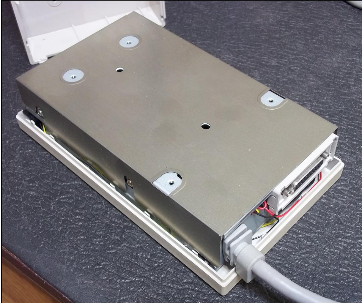
Figure 3. The additional metal housing found in the Apple 3.5 DrivePlus.