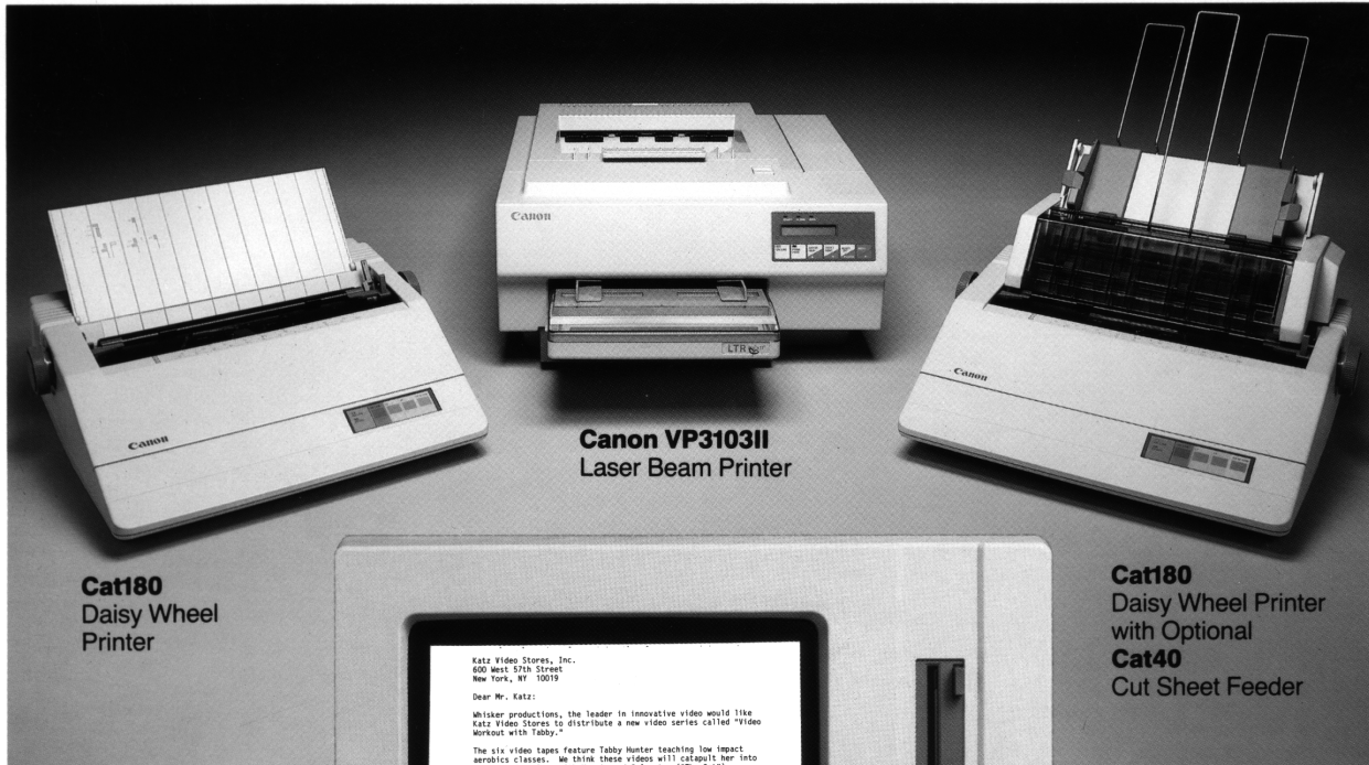
Cat180 Daisy Wheel Printer