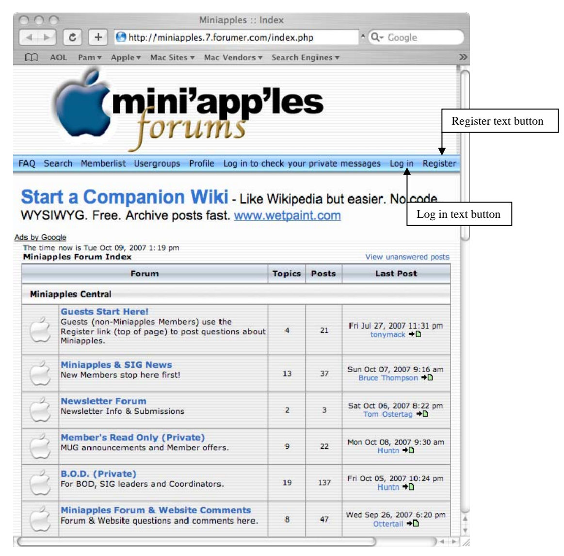
Figure 1. mini'app'les forumer.com Starting Window

Getting started is easy. Connect to the Internet and fire up your browser. Navigate to the mini'app'les BBS on forumer.com either by entering <u>http://miniapples.7.forumer.com/index.php</u> into the Address Bar of your browser or by going to the mini'app'les web site at <u>http://www.miniapples.org/</u> and clicking on the mini'app'les Forums Quick Link on the left side of the window. This brings up a window like the one in Figure 1.