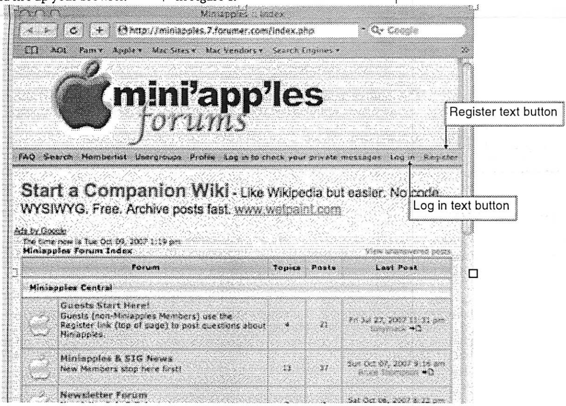
Figure 1. mini'app'les forumer.com Starting Window

The registration process begins when you click the "Register" text button at the right of the row of buttons just under the "mini'app'les forums" heading. At the click of that button, a new window appears; this window contains the registration agreement terms. If you agree to the terms and conditions, you need to click the appropriate line under that text to proceed. The next window asks you to enter your registration information and to set your initial preferences (see Figure 2).