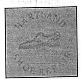
591 N. Hamline Ave. 651/646-4326

Tuesday-Friday 9am - 5:30pm Saturday 9am - Noon Closed Monday & Lunch (1-2pm)