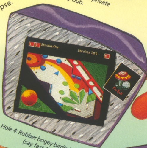
Hole 4: Rubber bogey birdie bumpers. (say fast 3 times)