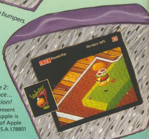
Hole 2: Get an ace... or indigestion!

Screen shots represent Apple IIgs version. Apple is a registered trademark of Apple Computer Inc. Made in the U.S.A. 178801