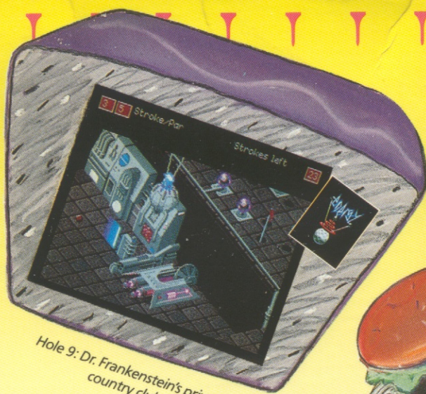
Hole 9: Dr. Frankenstein's private country club.

Unbelievable! Miniature golf beyond your wildest imagination. Nine of the craziest holes a golf ball's ever seen—all so incredi-ball, each one is like a separate arcade game. Here's a glimpse.