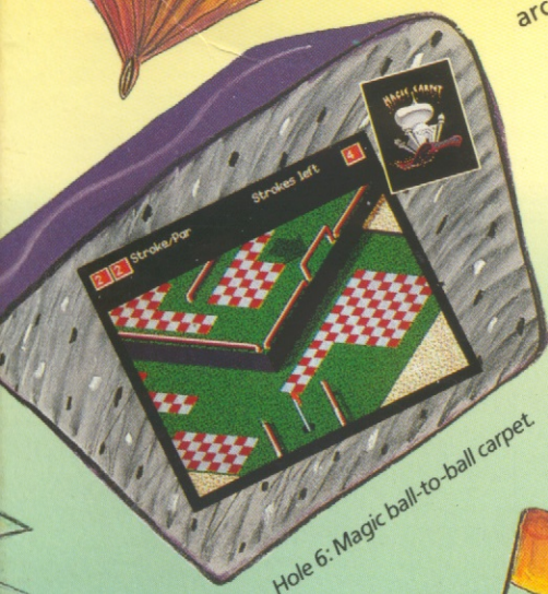
Hole 6: Magic ball-to-ball carpet.