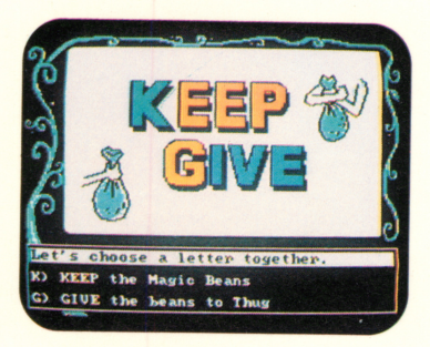
... then choose what happens next!