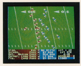
Take the field with your custom-built teams. Each player performs with the playing characteristics you've given them. Watch for the bomb from the "Accolads." The quarterback was "built" with a great am!