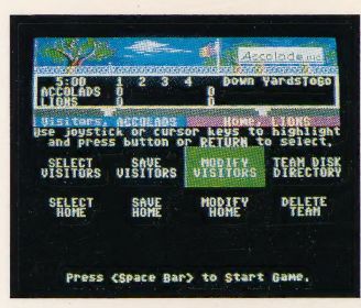
The Main Command screen presents your options. Selecting "Modify Visitors" allows you to create the visiting team. You can save that team to disk then call it up from the "Team Disk Directory."

The best in entertainment software.<sup>™</sup> 550 S. Winchester Blvd., San Jose, CA 95128