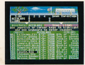
Here's the visiting line-up. Create everything from the player's name, height and weight to the team colors. Select each player's playing characteristics. Will your cornerbacks be speedy steady or just plain tough?