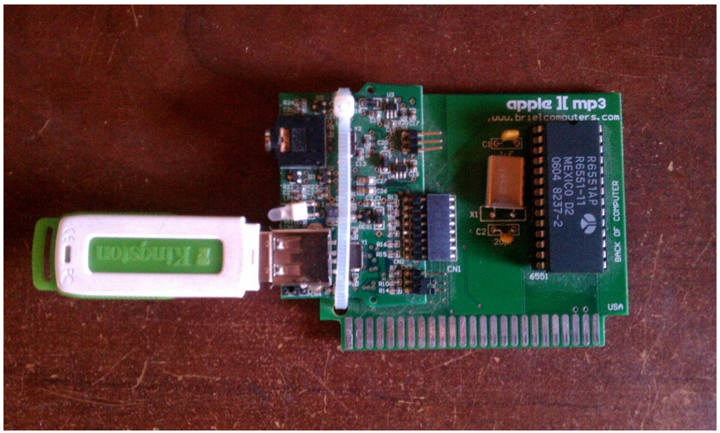
a2mp3 shown above with flash drive installed

The a2mp3 card is a hardware device that works in most slots to play mp3 files. The a2mp3 uses the VMUSIC controller to handle all mp3 decoding and audio output. Simply place mp3 files onto a flash drive (pen drive), run the supplied software and you are listening to mp3's right on your apple 2.