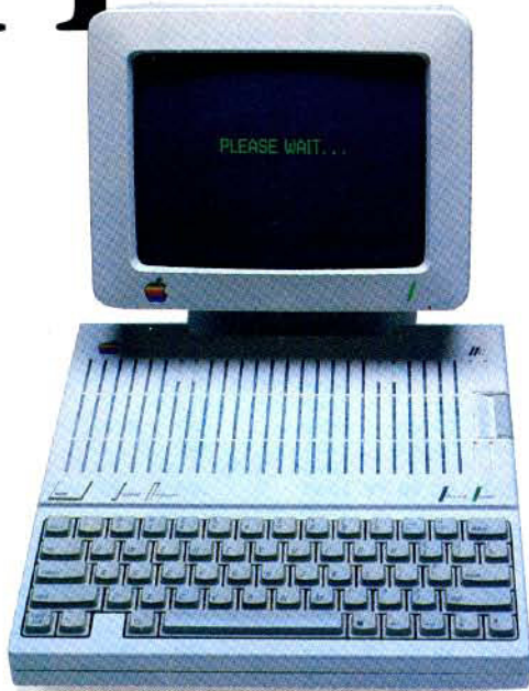
An Apple IIc