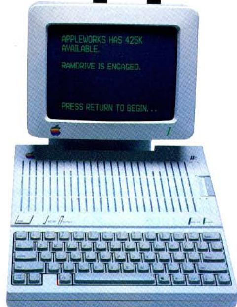
An Apple IIc with Z-RAM

The Apple IIc on the right works exactly the same as the Apple IIc on the left. Almost. The Apple on the right has a powerful memory expansion coprocessing card called Z-RAM. From Applied Engineering. Which means the Apple on the right can completely load AppleWorks into RAM—and then run it up to thirty times faster than the Apple on the left.